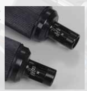
Above: 2 to 10 N type Below: 0.5 to 2.5 N type

Digimatic micrometer dedicated to applications requiring a constant/low measuring force such as measuring wire, paper, and plastic/rubber parts.