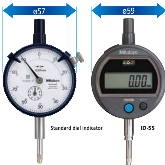
Standard dial indicator

These compact Digimatic indicators are approximately the same size as a standard dial indicator, so they can easily be used to replace such indicators. The solar-powered ID-SS eliminates the need for battery replacement, so just as with dial indicators there is no fear of the instrument losing power at an inconvenient time.