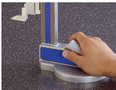
Base that fits the hand comfortably