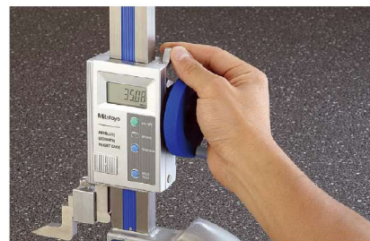
Large clamp lever