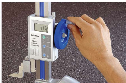
Slider height adjustment wheel