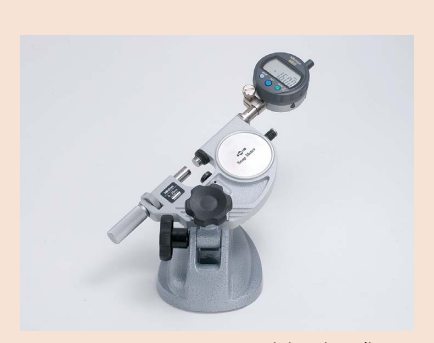
ABS Digimatic Indicator