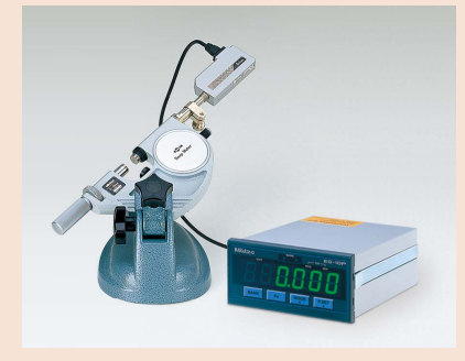
Linear Gage and counter