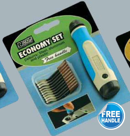
Economy Set NG8200 INCLUDES: NogaGrip-1- handle - NG1000 20 pcs. S10 blades - BS1010