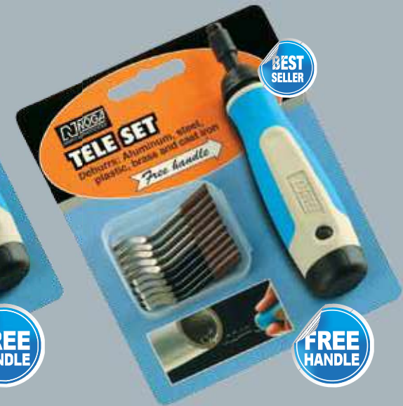
Tele Set NG8350 INCLUDES: NogaGrip-3- handle - NG3000 S Holder EL02003 5 pcs. S10 blades - BS1010 5 pcs. S20 blades - BS2010