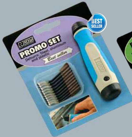
Promo Set NG8150 INCLUDES: NogaGrip-1- handle - NG1000 10 pcs. S10 blades - BS1010