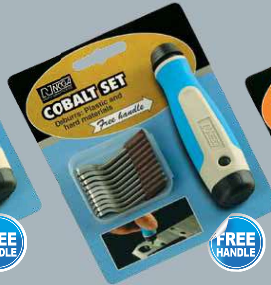
Cobalt Set NG8250 INCLUDES: NogaGrip-1- handle - NG1000 20 pcs. S100 blades - BS1018